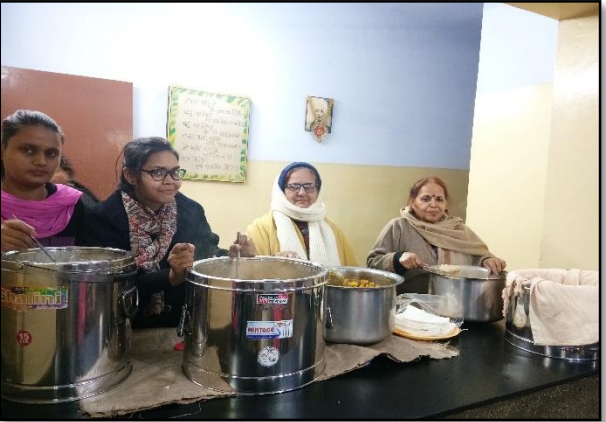
Fig: 4. Glimpse of solar cooker cakes; 5. Distribution of food by food incharges and wardens in a buffet system