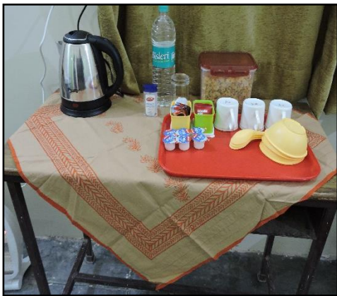
Fig.:4. Rooms provided to exchange students programme