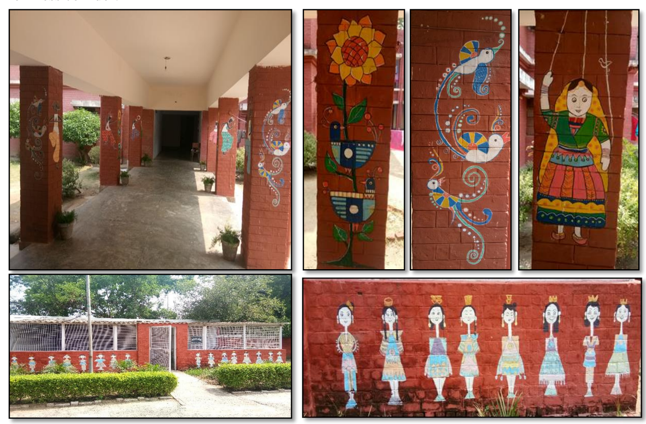
Fig. Murals outside dining hall and visitors' room

The hostel also recently organized a recreational activity to enhance the beauty of the hostel. The students of the hostel came together to paint murals on the walls of the visitor's room and the pillars of mess corridor.