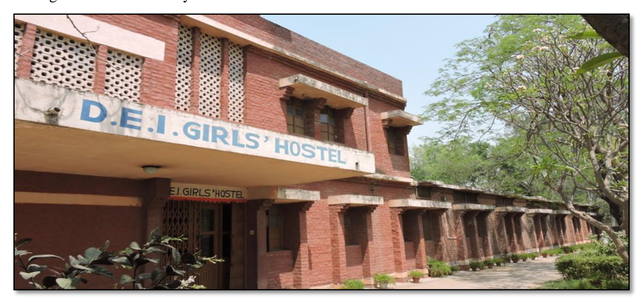
Fig: DEI Girls' Hostel entrance