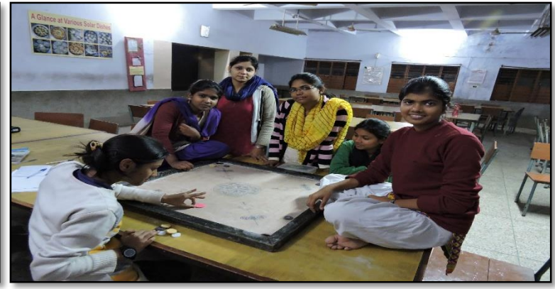
Fig. 1. Morning P.T., 2. Morning Yoga, 3. Chess Competition, 4. Carom Competition