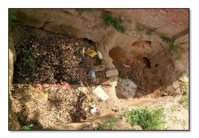
Fig. Compost Pit of the hostel

6. Preparing the compost in the hostel has led to an eco-friendly and cost effective way to manage the daily vegetables and tea wastes which is for the production of the compost. Hence, the hostel's kitchen garden can now sustain on its own and is independent from purchasing the compost from the market, as well as the excess of compost can also be provided outside the hostel.