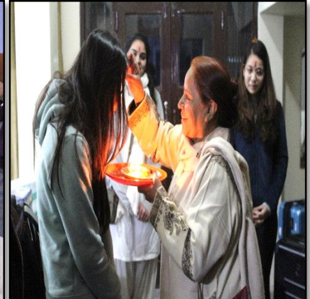
Fig.: 1. Welcome bhakti song by the students, 2.&3. Tilakam by the chief warden to the arriving students