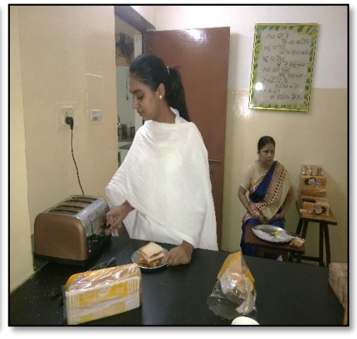
Fig.: 1. Water purifier with new water cooler, 2. Coffee, tea, and soup vending machine 3. Bread toaster